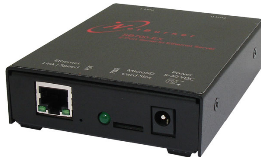
Figure 1: SB700EX

The documentation included in your kit includes tutorials, library function references and hardware platform details. All documentation is located in your C: directory