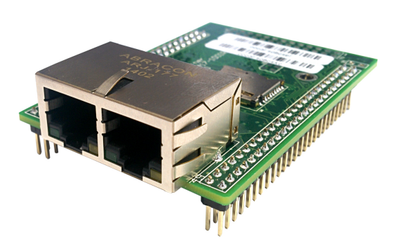
Figure 1: MOD54417