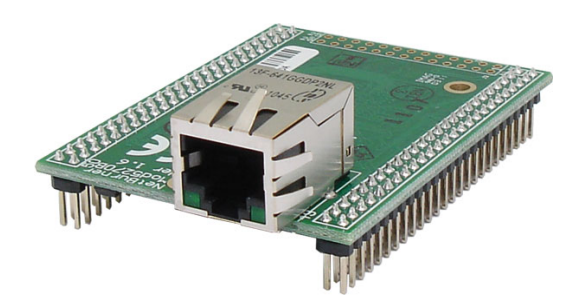
Figure 1: MOD5270