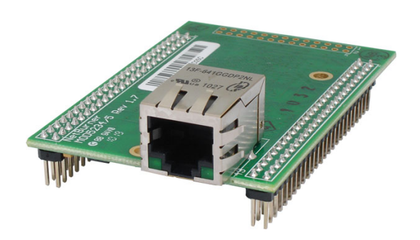
Figure 1: MOD5234