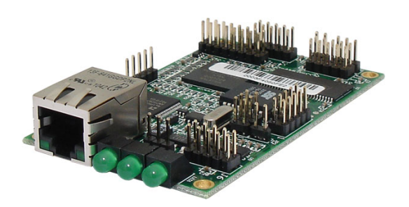
Figure 1: SB72

The SB72 with NetBurner Network Development Kit (NNDK) is the fastest way to develop your network product. This kit includes everything you need to create network applications, and all the hardware and software components are integrated in a complete and easy to use package. For specific hardware information please read your Hardware User's Manual (located in C:). All documentation is located in your C: directory.