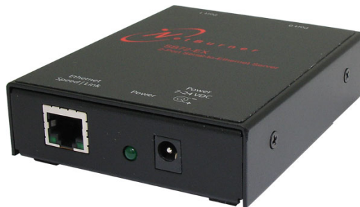
Figure 1: SB72EX

For specific hardware information please read your SB72EX Hardware User's Manual (located in C:). All documentation is located in your C: directory.