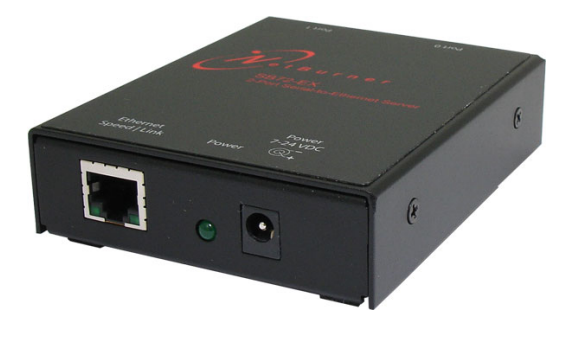
Figure 1: SB72EX

For specific hardware information please read your SB72EX Hardware User's Manual (located in C:). All documentation is located in your C: directory.