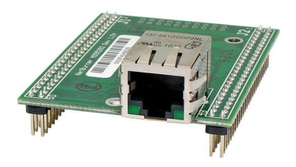
Figure 1: MOD5282